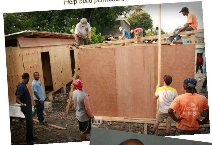
Help build permanent homes

PREPARATION: As soon as Forward Edge receives completed applications, we'll send you a team pack: T-shirt, training materials, packing list and information about Haiti. Please note: FEI strongly recommends that each team member checks with his or her doctor before embarking. We are currently requiring that each team member have a prescription for Cipro and also brings Rehydration Salts and Electrolytes with them. We also recommend current shots for Tetanus and Typhoid and medication for Malaria. Team members may also want to consider vaccinations for Hepatitis A & B, Meningitis or H1N1. Again consult with your physician for the most up to date immunization recommendations.