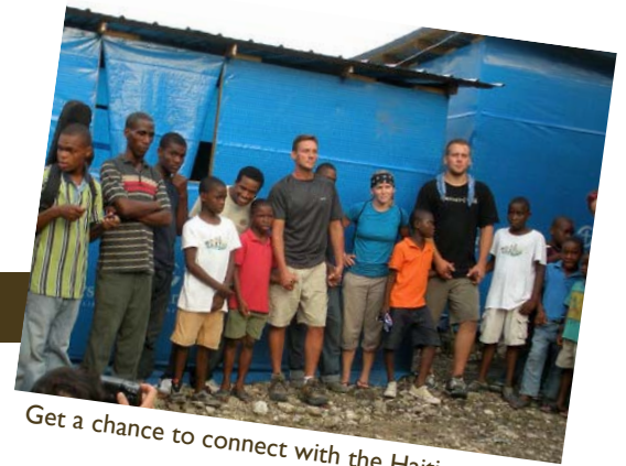
Get a chance to connect with the Haitian people

WHAT WILL WE BE DOING? Teams will be given the opportunity to serve in a variety of ways, both relationally and physically. The need in Haiti is great, and teams should expect to do anything related to disaster relief and protecting and encouraging vulnerable children. Projects will be determined on a variety of criteria, but the primary deciding factor will be going where the need is greatest.