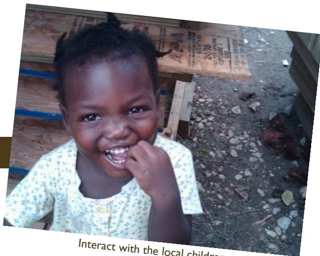
Interact with the local children.