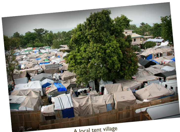
A local tent village